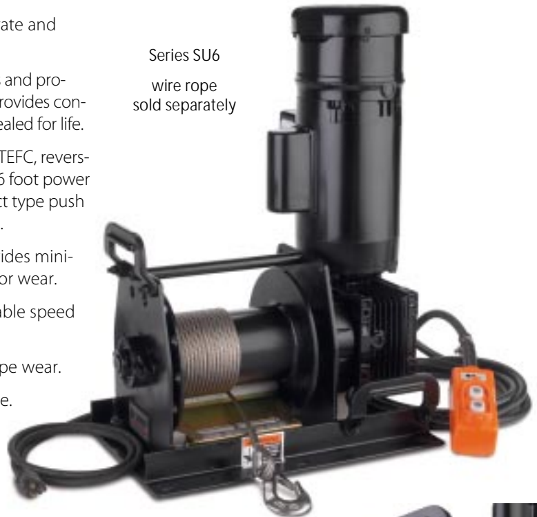
Series SU6 wire rope sold separately