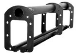
T60 Straight Track