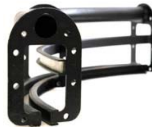
T60 Curved Track